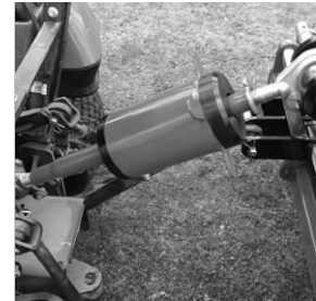
Adjustable Cross shows to the top

SHOCKex is a spring-assisted absorber system, which protects mounting parts, bearings, and the tractor including the implement. Thereby all components will be prevented of damage. The traceability of the carrier vehicle will be substantially better. Safety, roadworthiness and material protection will increase significantly. That effects also an increase of the lifetime of carrier vehicle and working machine.